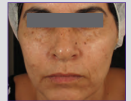
1 month follow up