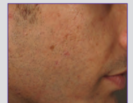
1 month after 3rd treatment

All Before and After photographs are of real patients, your results may vary.