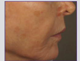
1 month after 2nd treatment